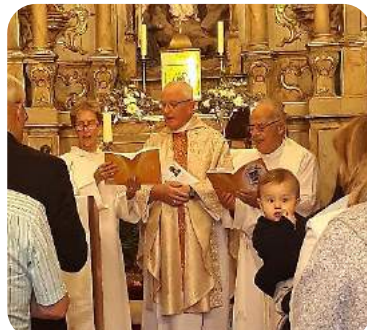
Celebrating Mass together, 4 years ago -12/01/2020